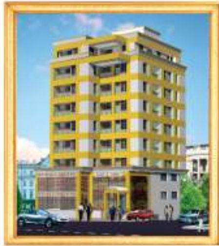
Sun Sapphire Kesavadasapuram