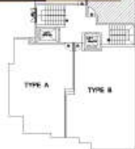
Floor Plan 2nd - 11th