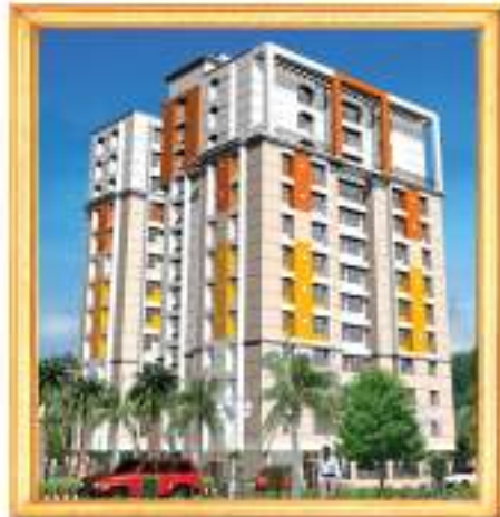
Sun Elegance Porajapuram