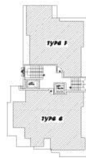
Floor Plan 12th

Dimensions may vary during construction. Furniture and fixtures are indicative only.