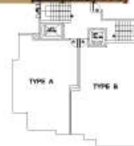
Floor Plan 2nd - 11th