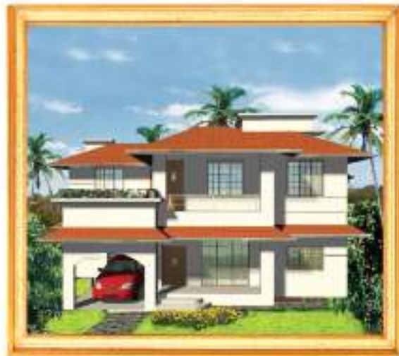
Sun Gardens Puliyankovam