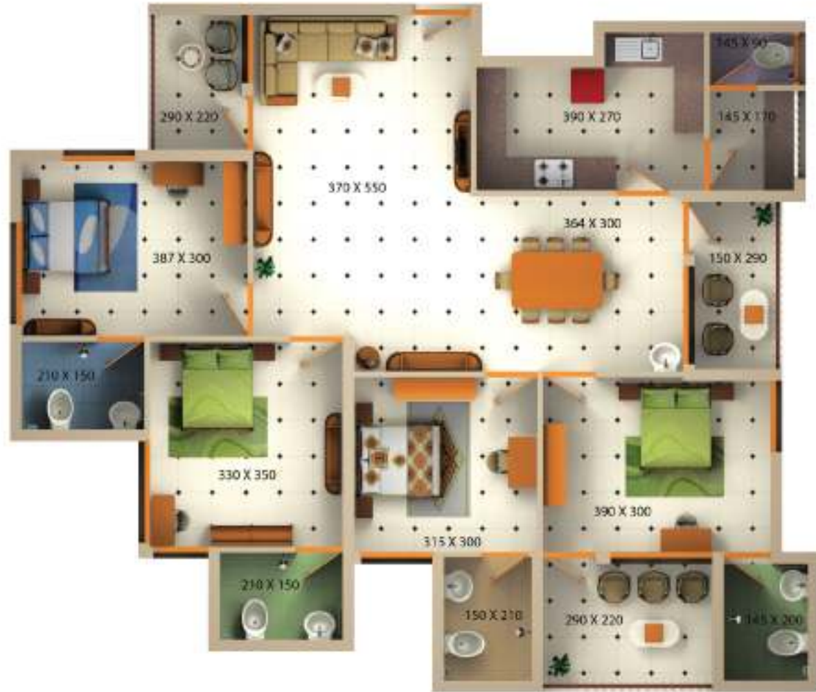
TYPE E AREA - 1800 Sq. Ft. Three Bedroom Apartment

Dimensions may vary during construction. Furniture and fixtures are indicative only.