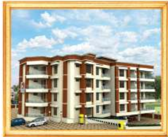
Sun Axis Vikas Bhavan