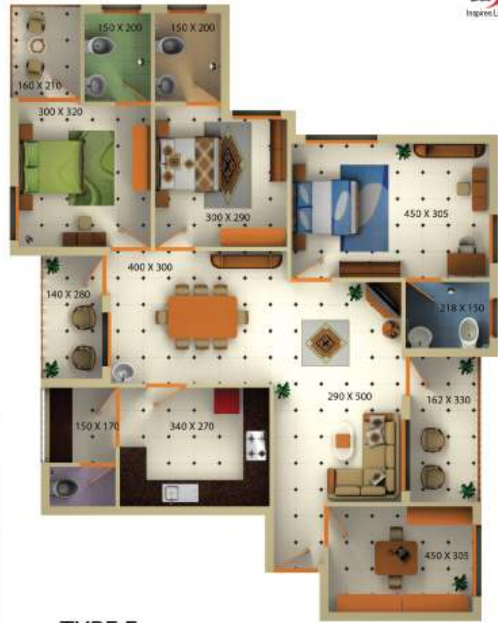
TYPE F AREA - 1750 Sq. Ft. Three Bedroom Apartment

Dimensions may vary during construction. Furniture and fixtures are indicative only.