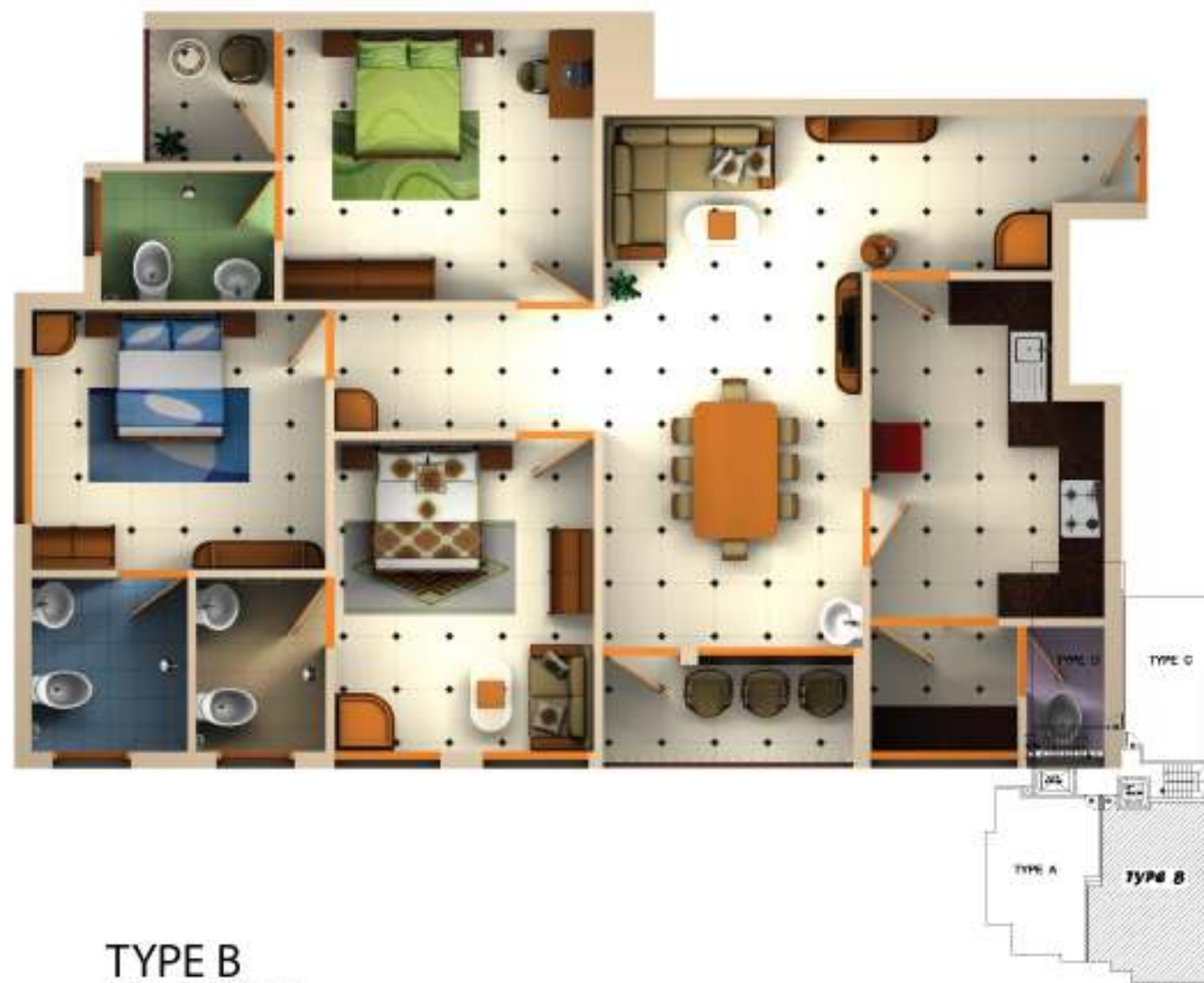
TYPE B AREA - 1390 Sq. Ft. Three Bedroom Apartment

Dimensions may vary during construction. Furniture and fixtures are indicative only.